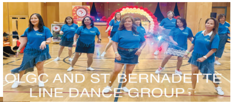
OLGC AND ST. BERNADETTE LINE DANCE GROUP