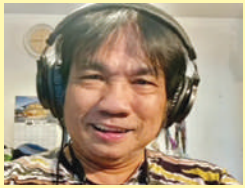
The Tall Order By Mon Datol