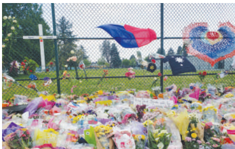
The April 26, 2025 Lapu-Lapu festival tragedy claimed 11 lives.

Survivors and families of victims of the 2025 festival tragedy in Vancouver are asking to meet with United Way BC, the charity that administered the special fund raised from donations following the traumatic incident.