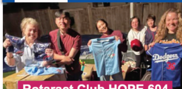
Rotaract Club HOPE 604