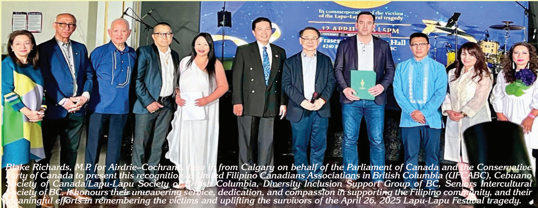
Blake Richards, M.P. for Airdrie-Cochrane, flew in from Calgary on behalf of the Parliament of Canada and the Conservative Party of Canada to present this recognition to United Filipino Canadians Associations in British Columbia (UFCABC), Cebuano Society of Canada/Lapu-Lapu Society of British Columbia, Diversity Inclusion Support Group of BC, Seniors Intercultural Society of BC. It honours their unwavering service, dedication, and compassion in supporting the Filipino community, and their meaningful efforts in remembering the victims and uplifting the survivors of the April 26, 2025 Lapu-Lapu Festival tragedy.