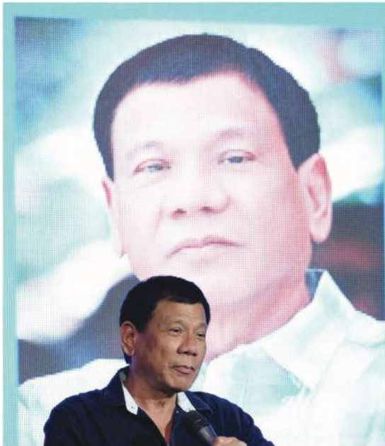
The ICC is expected to issue a couple of rulings on April 22 and April 28 in the case involving ex-president Rodrigo Duterte.

to provide further evidence, conduct further investigations, or amend any charge for which the evidence submitted appears to establish a crime.