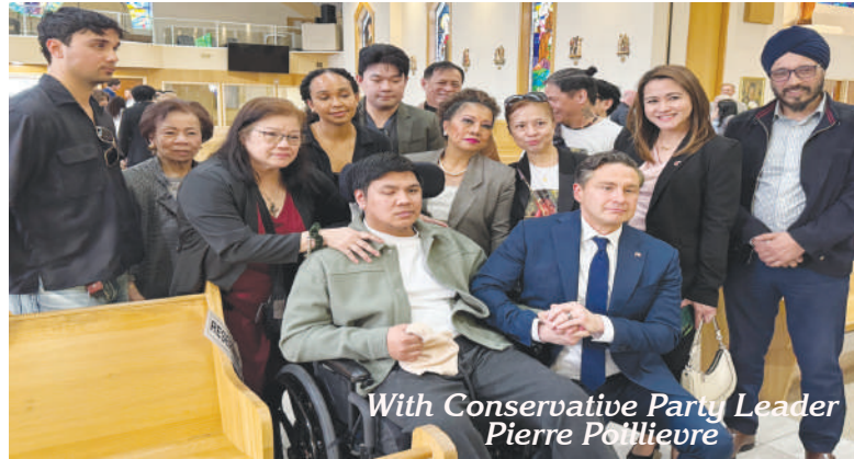
With Conservative Party Leader Pierre Poilievre

Vancouver, BC, April 10, 2026, With heavy hearts and unwavering unity, the community gathered at St Andrew's Parish for a Commemoration Memorial Mass marking one year since the tragic events at the Lapu-Lapu Festival on April 26, 2025.