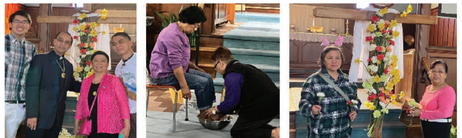
Lenten pictures: Blessing of the Palms, making the Stations of the Cross, Washing of the Feet, Easter Sunday.