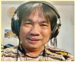
The Tall Order By Mon Datol